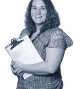
The Care Manager

Information technology (IT) systems complement the role of the care manager. IT tools include a tracking database, patient summary sheet, and electronic messaging systems. Reports are generated for ongoing assessment and administration of a care management program.