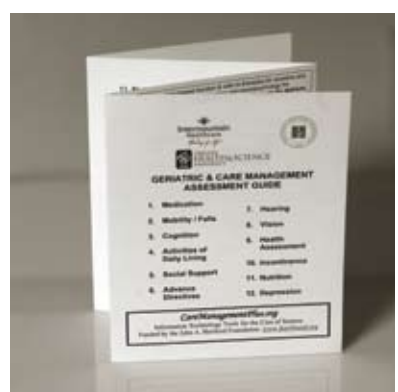
Care Management Plus provides a variety of printed and virtual tools to assist both doctors and older patients in managing complex health conditions.