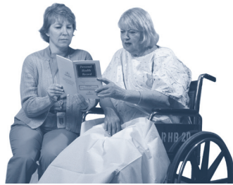
PATIENT LEAVING THE HOSPITAL