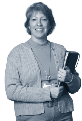
The Transition Coach

Prior to discharge from the hospital, a specially trained nurse (the coach) visits the patient to begin the process of a successful transition to self management at home.