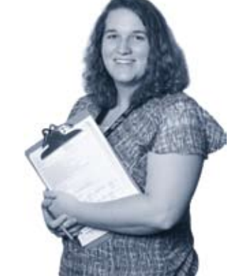
The Care Manager

Information technology (IT) systems complement the role of the care manager. IT tools include a tracking database, patient summary sheet, and electronic messaging systems. Reports are generated for ongoing assessment and administration of a care management program.